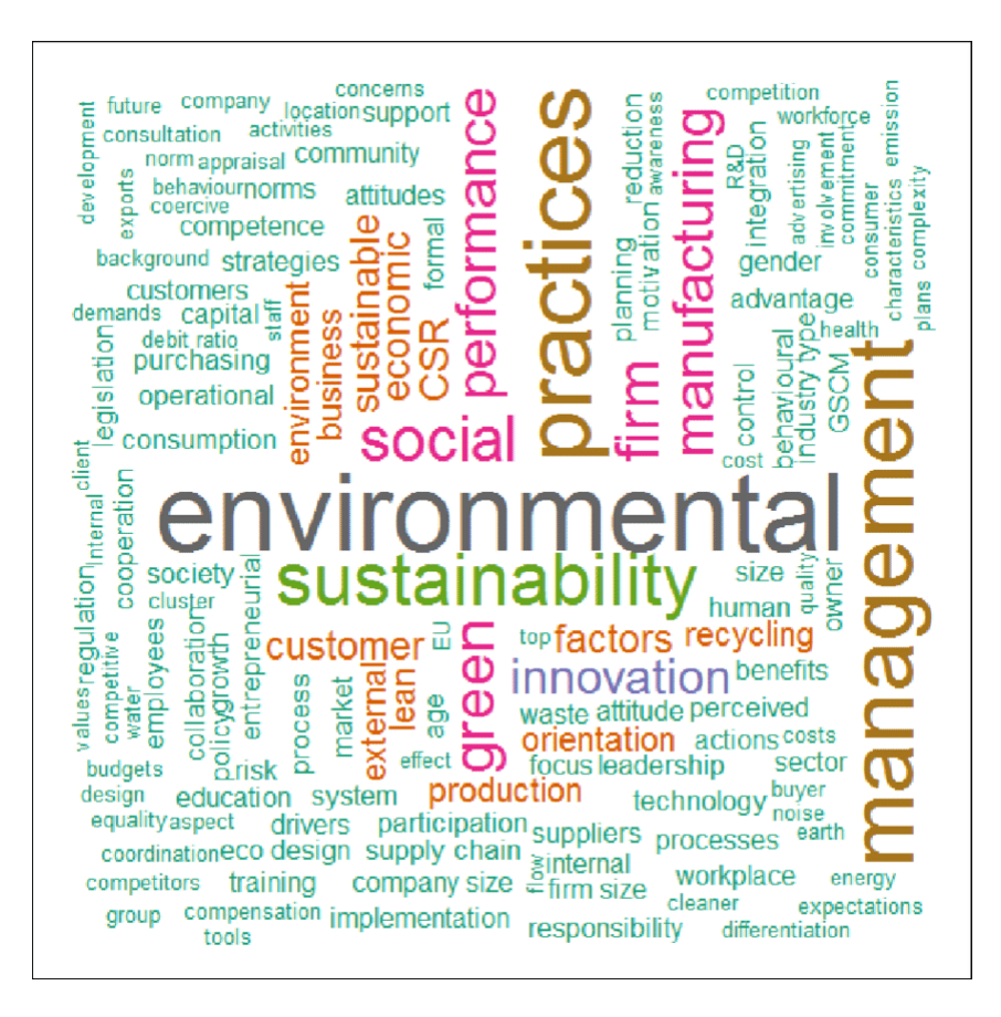
Figure 1: sustainability word cloud from Malesios et al. (2020)

Another approach could be to start from an ecological perspective, which sees natural cycles that support ecosystems as the implicit foundation of any discussion of sustainability. An overview of these natural systems is necessary as the basis for exploring the impacts of different economic systems and activities. A few natural cycles could be introduced in early lectures or virtual material. These might include the carbon cycle, making connections with climate change; and the hydro cycle, with a focus on areas of water shortage and the food chain, with discussion of the need for dietary changes if a growing population is to be supported. The advantage of exploring the ecological perspective from the outset is that the concept of sustainability is readily understood. If this approach is followed, the concept can be introduced as the preservation and encouragement of these natural cycles and ecosystems to maintain or increase bio-diversity.