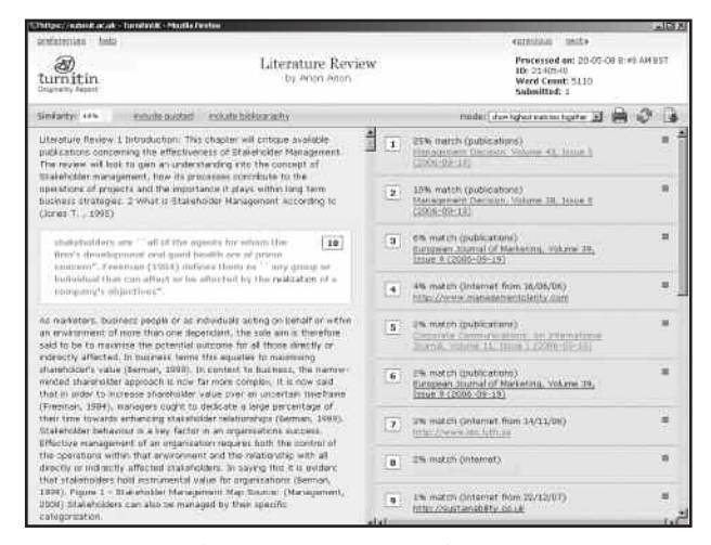
Figure 3. Part of an originality report from Turnitin

the pilot that the similarity scores should be interpreted carefully and not mechanically. Looking at Figure 3 you can see that the report can be produced including or excluding both quoted text and bibliographic references. Here these types of matching text have been excluded. An even higher match might be found if the options to include either or both of these categories had been chosen. In the case shown here it does look as if there is a problem with large sections of text being copied from the journal Management Decision, but it is unlikely that even completely original work would produce a score of zero. Some positive scores are inevitable due to the standard phrases that are used in any subject (e.g. supply and demand, elasticity of demand, regression results etc.). Discretion must be used by staff in judging whether submitted work falls foul of anti-plagiarism requirements or not.